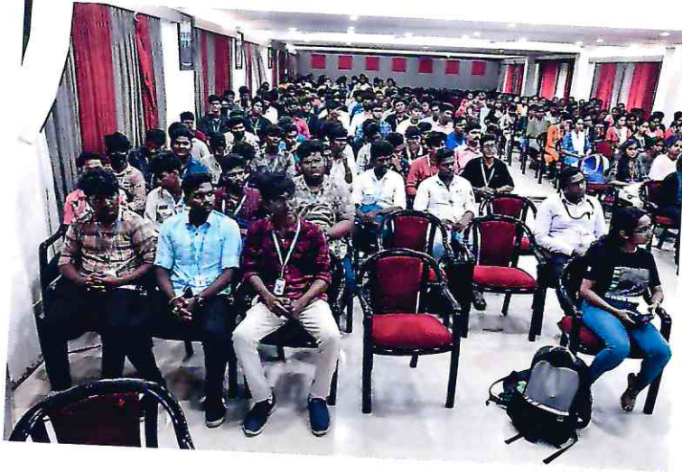
Awareness on One Million Ideas - EDC - Participants attending the program