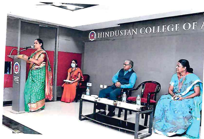
Career Guidance Programme on Company Secretaryship – Guest speaker interaction with the audience