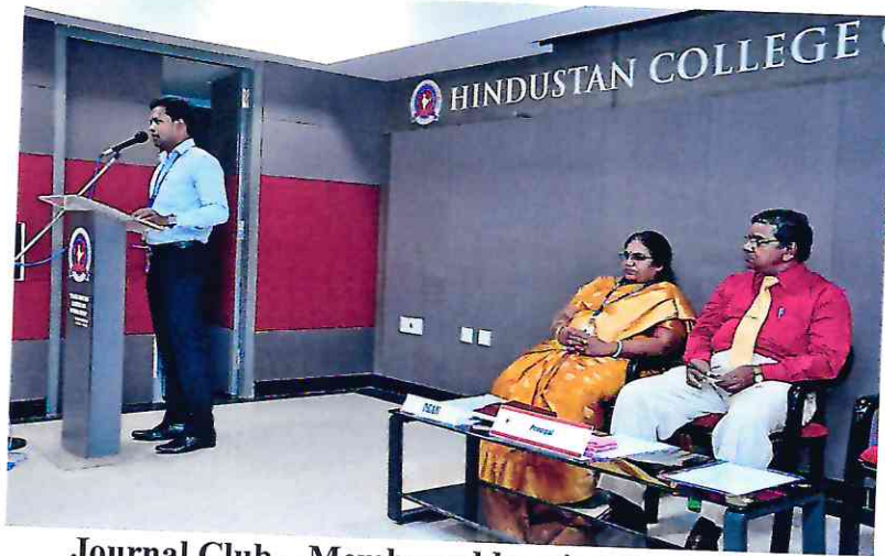
Journal Club – Member addressing the audience