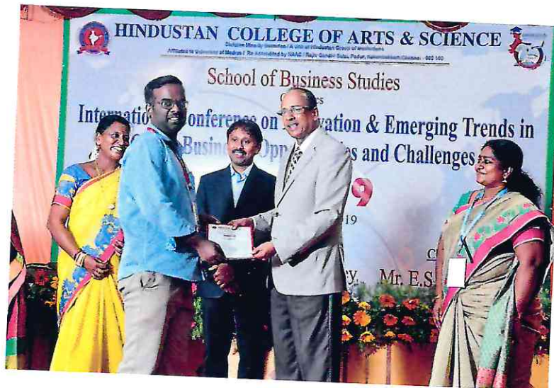
Conference on “Innovation & Emerging Trends in Global Business-Opportunities and Challenges” – Participants receiving certificate