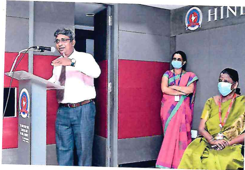
Orientation Programme on Entrepreneurship Development – Guest speaker