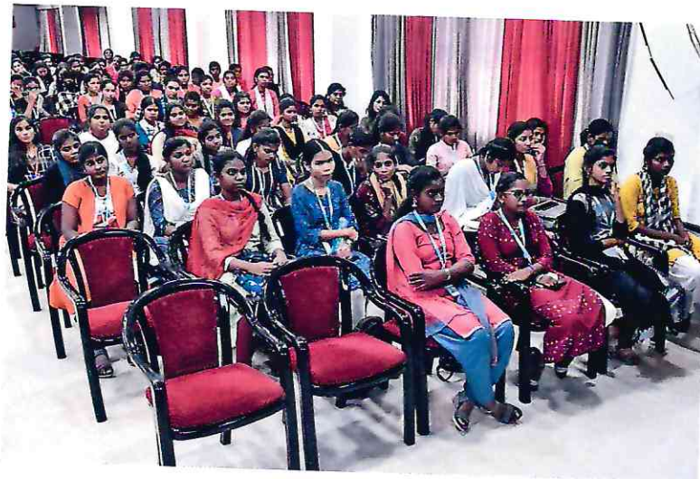
Possibilities and Opportunities in Biotech-Research, Innovation and Entrepreneurship – Participants attending the program