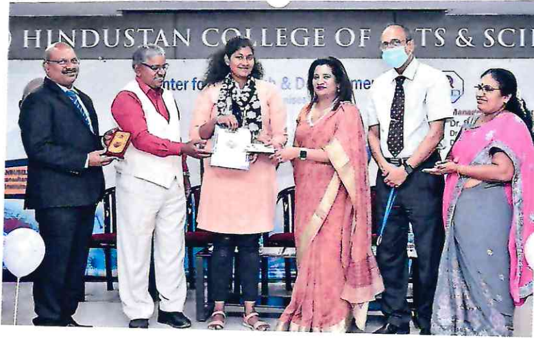
Student receiving certificate for TNSI 2021 Innovator Awards