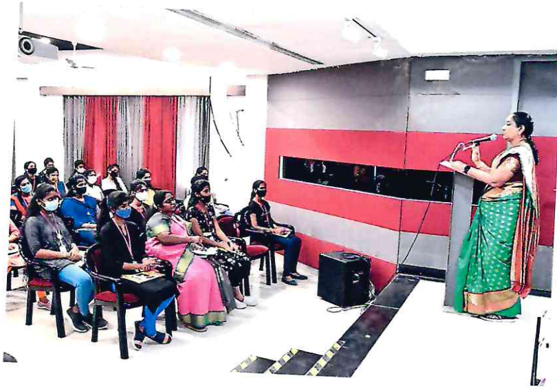
Career Guidance Programme on Company Secretaryship – Guest speaker