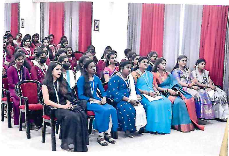
Saliva Diagnostics and Bio-entrepreneurship-A Newer Career - Participants attending the program