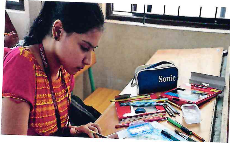
Media Recording – Students attending the program