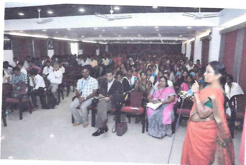
Workshop on “Business Outcomes on Food Products” – Guest speaker interacting with the participants