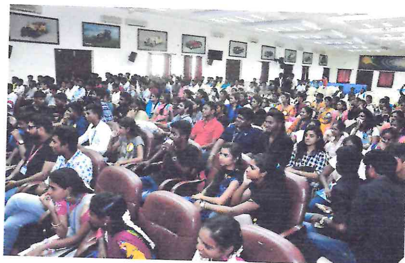
Workshop on “Wealth from Waste” – Participants attending the program