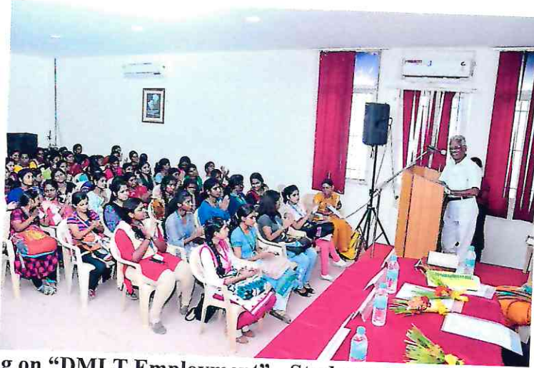
Training on "DMLT Employment" - Students attending the program