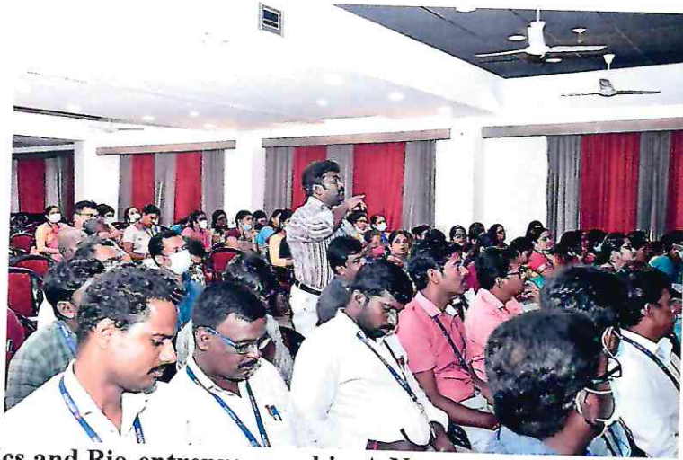
Saliva Diagnostics and Bio-entrepreneurship-A Newer Career - Participants interacting with the guest speaker