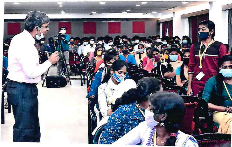
Orientation Programme on Entrepreneurship Development – Guest speaker interaction with students