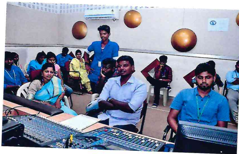
Media Recording – Members in recording room