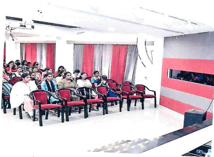
Awareness on One Million Ideas - EDC - Participants attending the programme