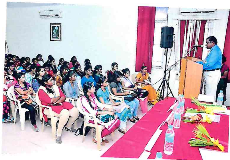
Training on "DMLT Employment" - Students attending the program