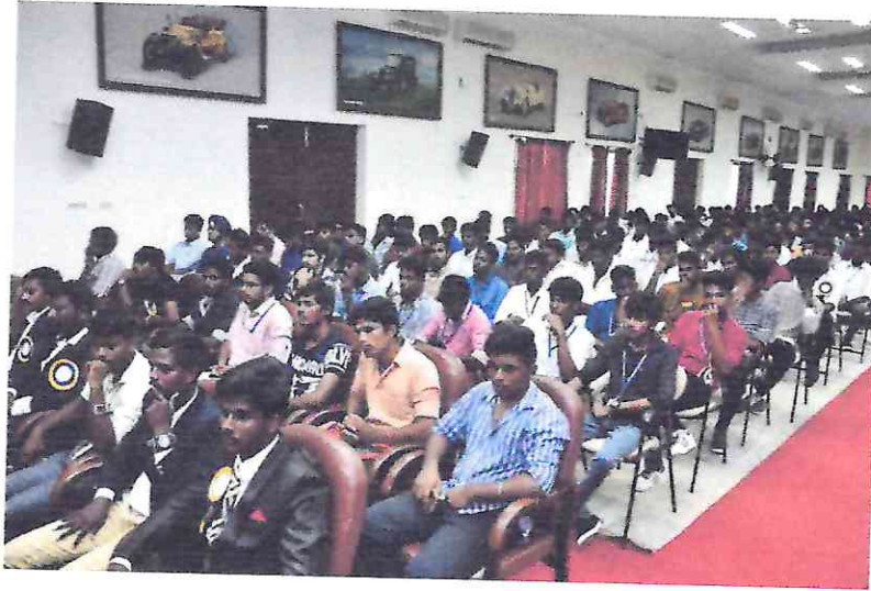
Entrepreneurial Development Program (EDP) – Participants attending the program