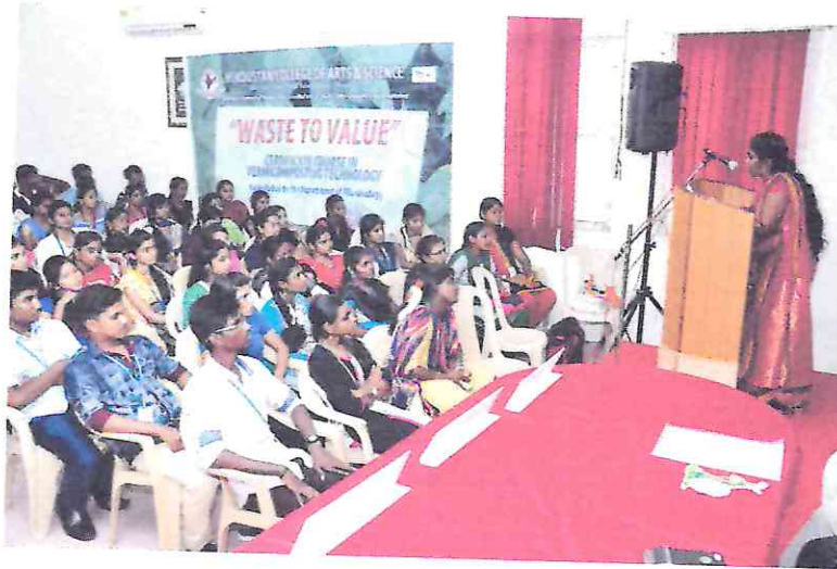
Waste to Value - Students attending the program