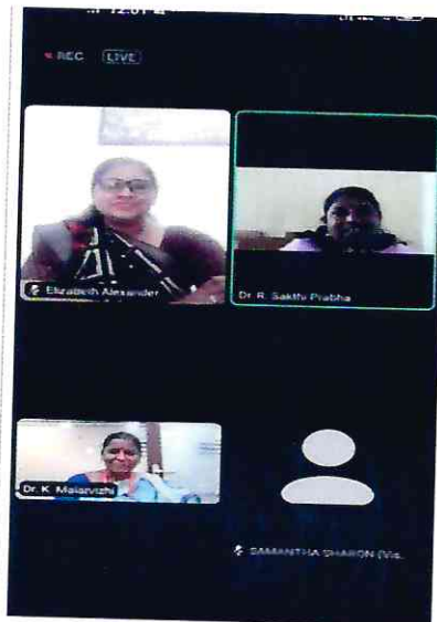
Social Entrepreneurship Scope & Challenges – Participants attending the program