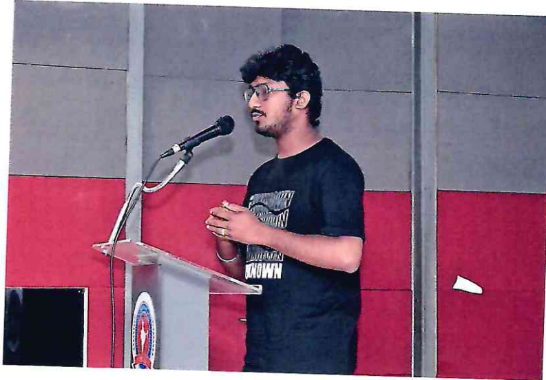
Possibilities and Opportunities in Biotech-Research, Innovation and Entrepreneurship – Guest speaker