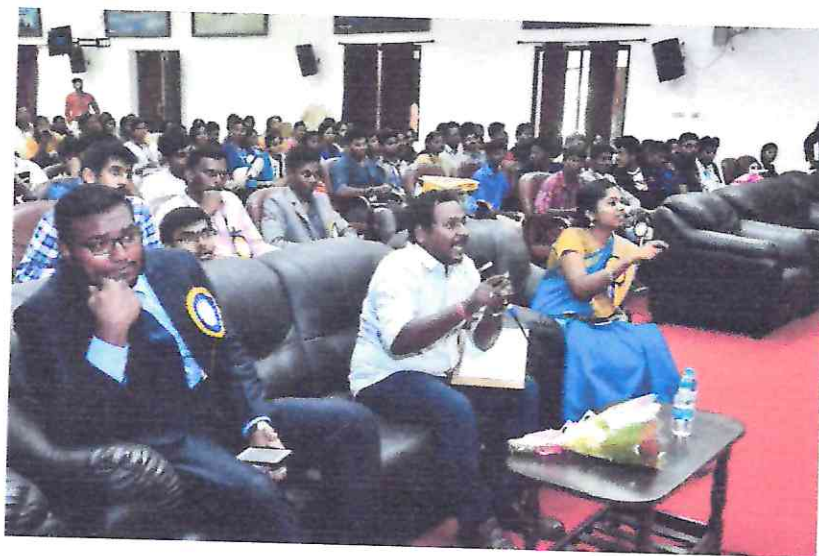
Workshop on “Wealth from Waste” – Participants attending the program