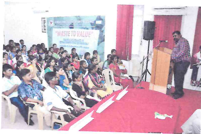
Waste to Value – Guest speaker interacting with students