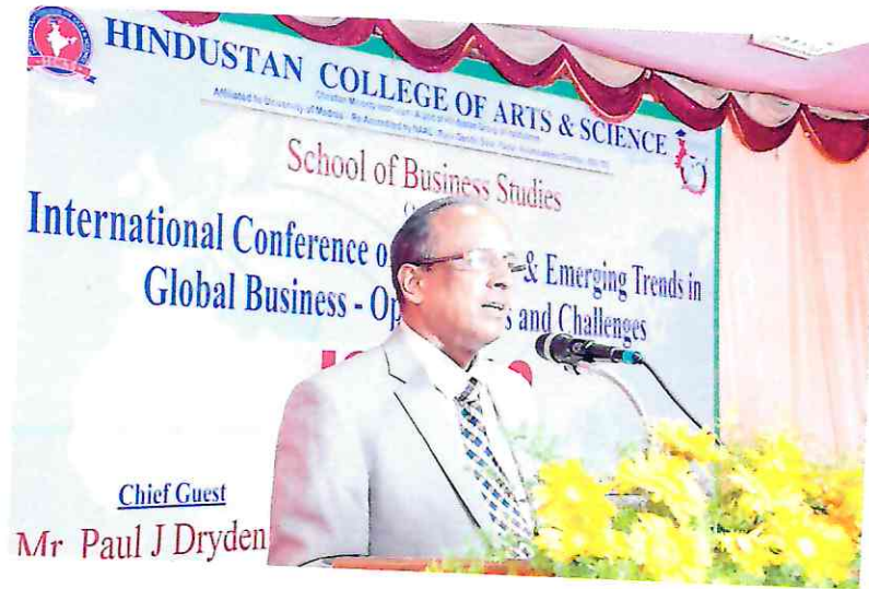
Conference on “Innovation & Emerging Trends in Global Business-Opportunities and Challenges” – Deputy Director addressing the audience