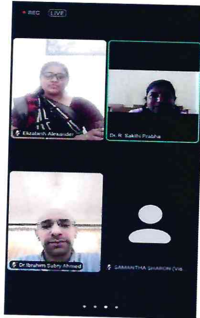
Social Entrepreneurship Scope & Challenges – Participants attending the program