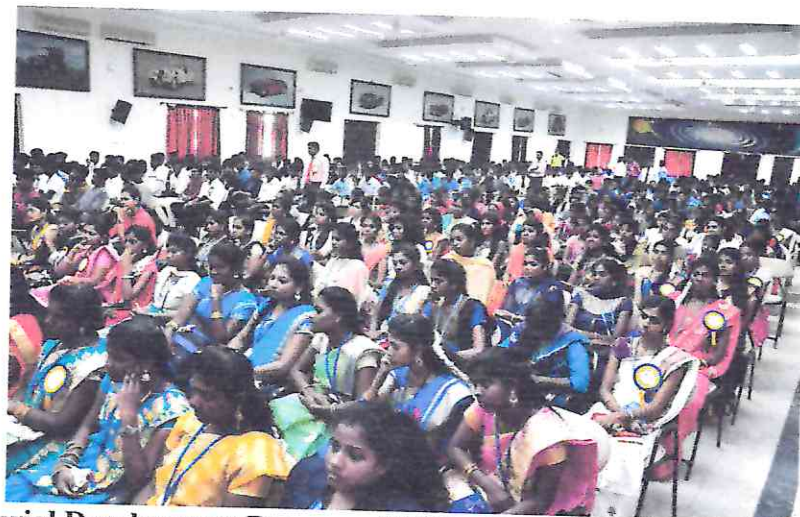
Entrepreneurial Development Program (EDP) – Participants attending the program