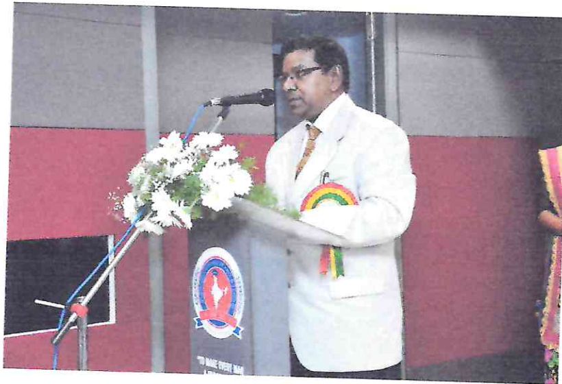
Workshop on “Business Outcomes on Food Products” – Principal presenting the welcome address