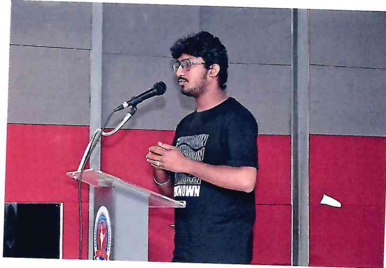
Possibilities and Opportunities in Biotech-Research, Innovation and Entrepreneurship – Guest speaker