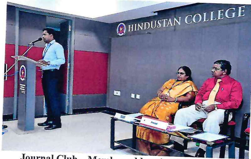
Journal Club – Member addressing the audience