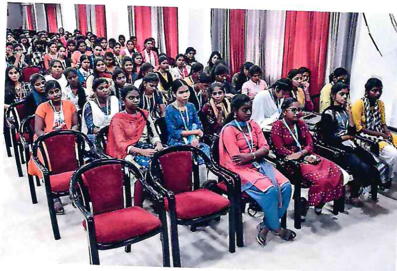
Possibilities and Opportunities in Biotech-Research, Innovation and Entrepreneurship – Participants attending the program