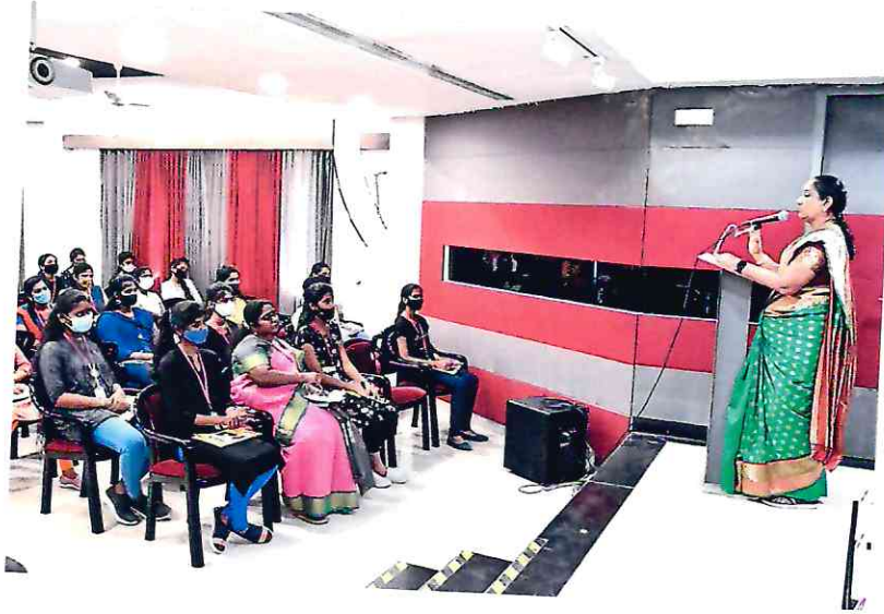
Career Guidance Programme on Company Secretaryship – Guest speaker