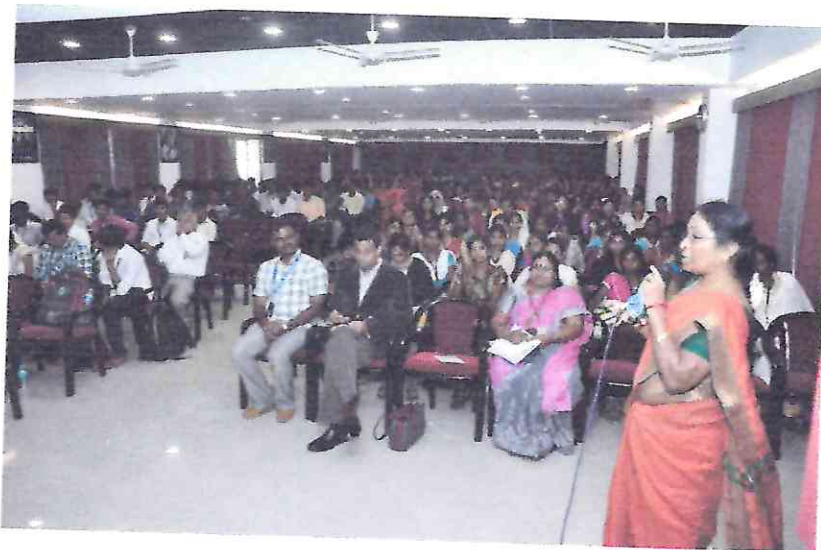
Workshop on “Business Outcomes on Food Products” – Guest speaker interacting with the participants