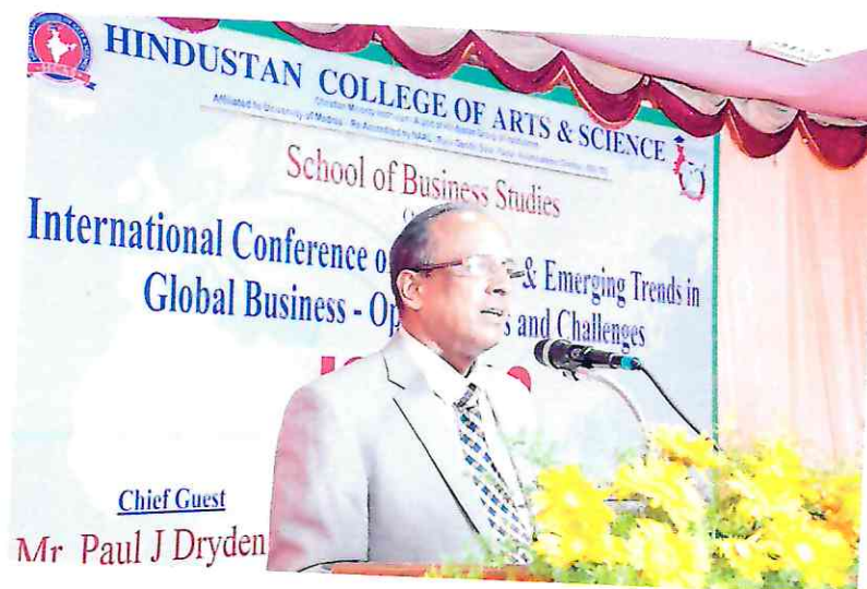
Conference on “Innovation & Emerging Trends in Global Business-Opportunities and Challenges” – Deputy Director addressing the audience