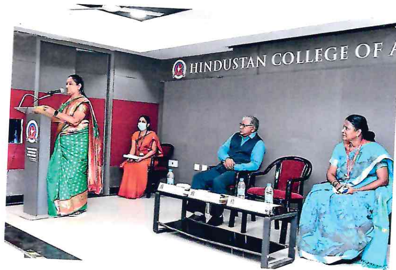
Career Guidance Programme on Company Secretaryship – Guest speaker interaction with the audience