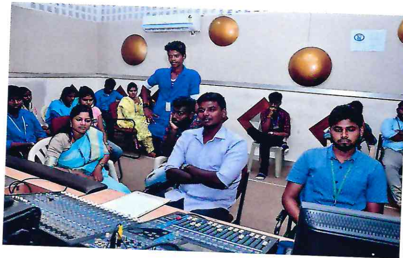
Media Recording – Members in recording room