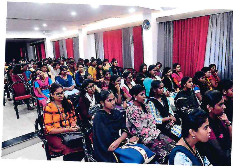
Journal Club – Researchers and students attending the program