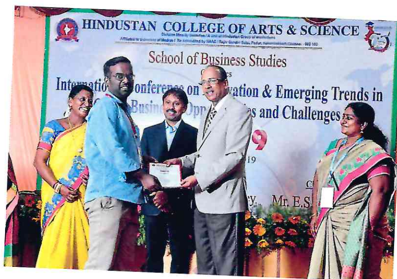
Conference on “Innovation & Emerging Trends in Global Business-Opportunities and Challenges” – Participants receiving certificate